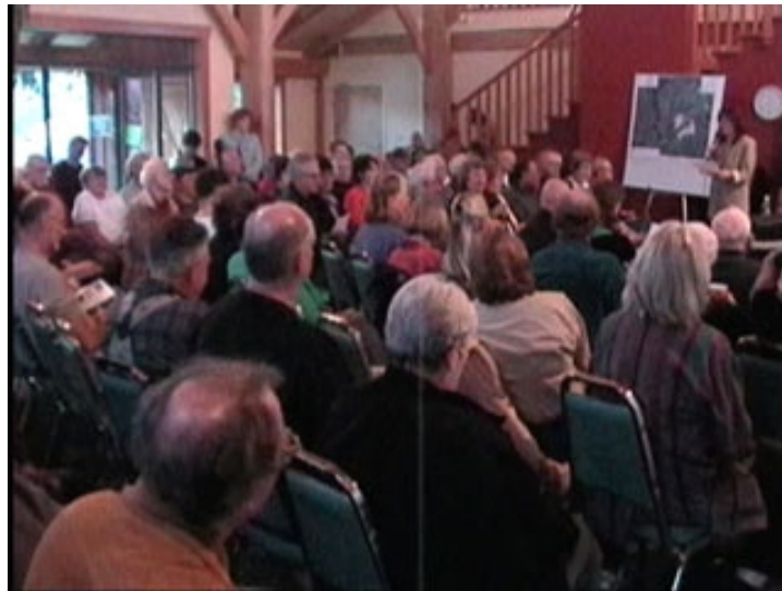
Packed meeting room.

(Photo compilation and audio transcript segments from digital video. Note: some of the speakers name could not properly be heard in the audio tape, so their names are not provided. Hopefully the spelling of the names provided are correct. Information about the Community Forest Tenure application are found on the District of Sechelt's website, www.district.sechelt.bc.ca )