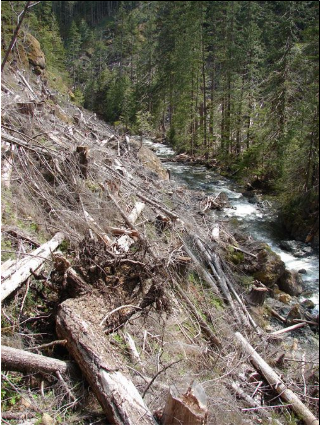
Photo 2. Looking from up-creek section of violation, southwards, down-creek, along the extent of the violation. Note the extremely narrow buffer of one to two tree trunk diameter widths (two meters) on the opposite side of the Creek, directly below steep mountain side clearcut logging.