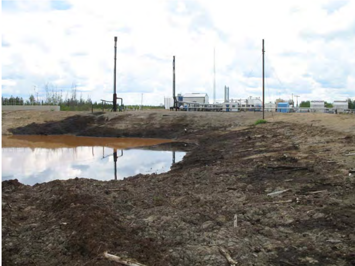
..... An example of oil and gas site contamination before restoration