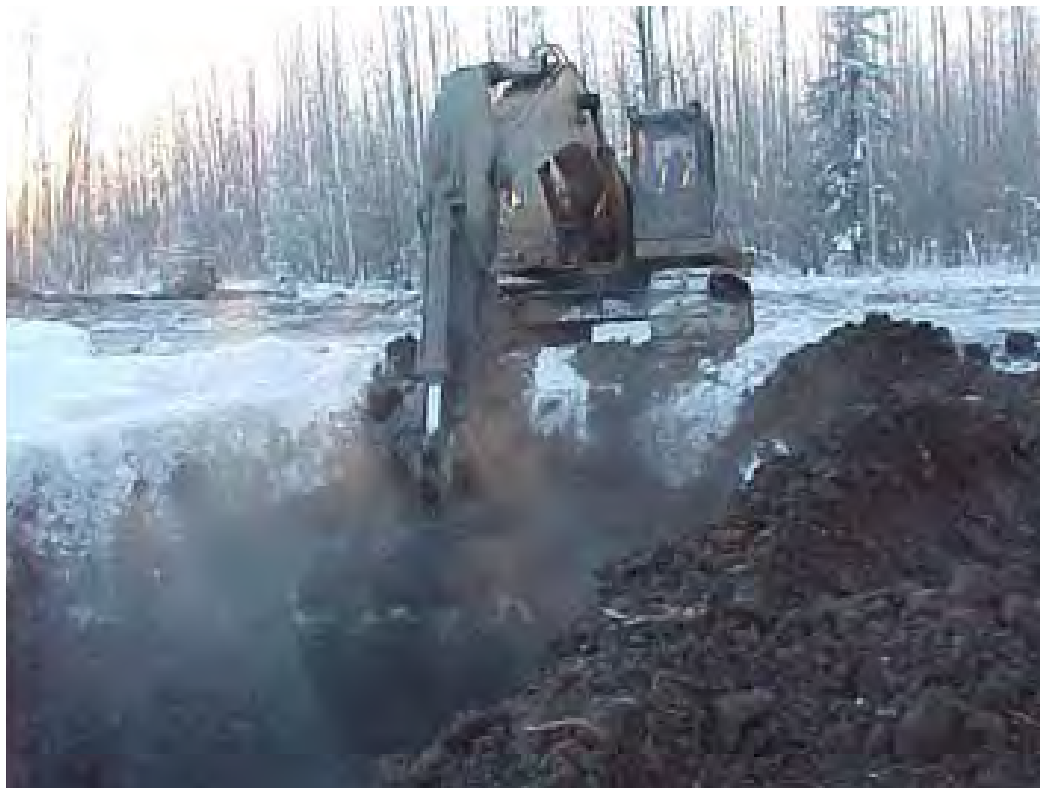
..... A site undergoing restoration during winter