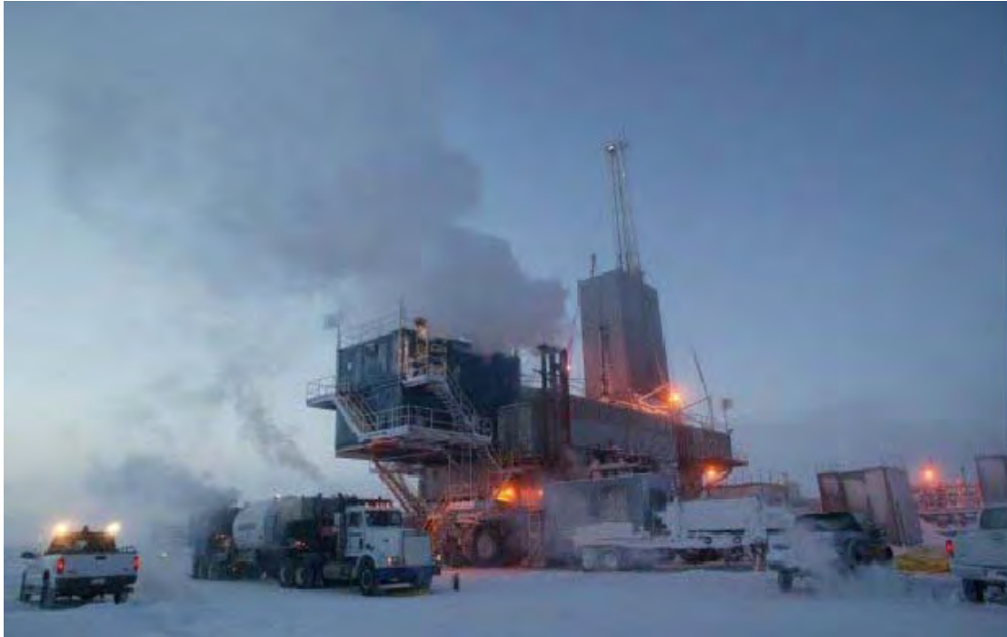
An oil and gas drilling site in northeast British Columbia

Membership in the task group is composed of representatives from government departments, regulators, the upstream petroleum industry and subject matter experts. Industry representation is coordinated through the Canadian Association of Petroleum Producers. Government representation includes the Ministry of Environment, the Ministry of Energy, Mines and Petroleum Resources, the OGC, the Ministry of Agriculture and Lands, and other government agencies and departments as needed. The task group has worked to support the development of a number of different technical standards.